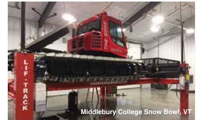
Middlebury College Snow Bowl, VT