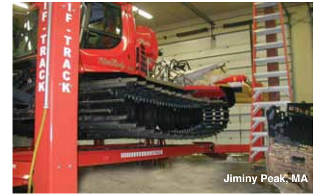
Jiminy Peak, MA