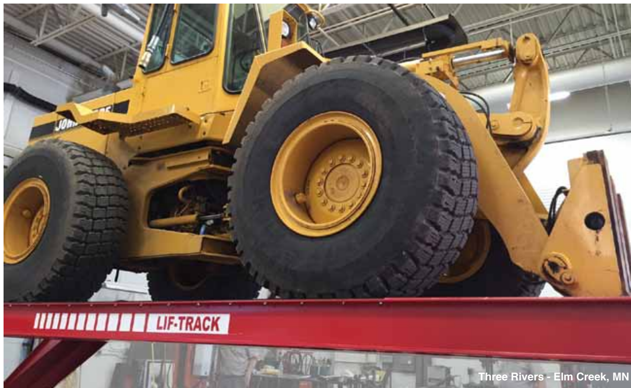
Three Rivers - Elm Creek, MN

Improved Preventive Maintenance with LIF-TRACK = Lower Cost .... and a Higher Quality of Work!