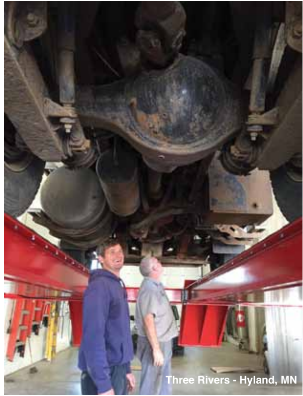
Three Rivers - Hyland, MN

“I only wish I had invested in LIF-TRACK sooner. I had no idea how beneficial it would be to our Vehicle Maintenance Dept until I saw for myself.”