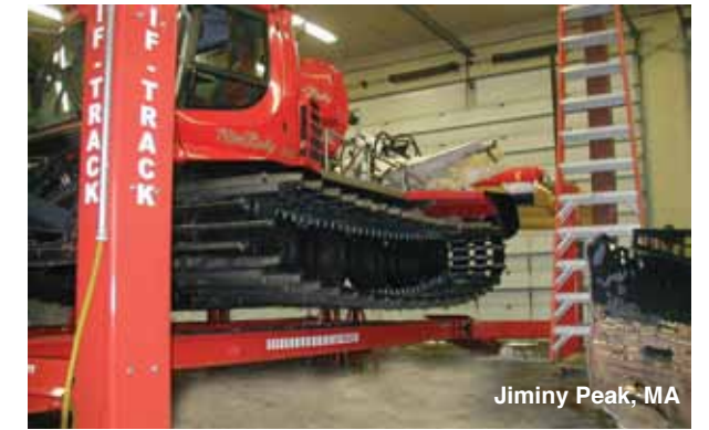
Jiminy Peak, MA