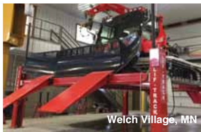
Welch Village, MN