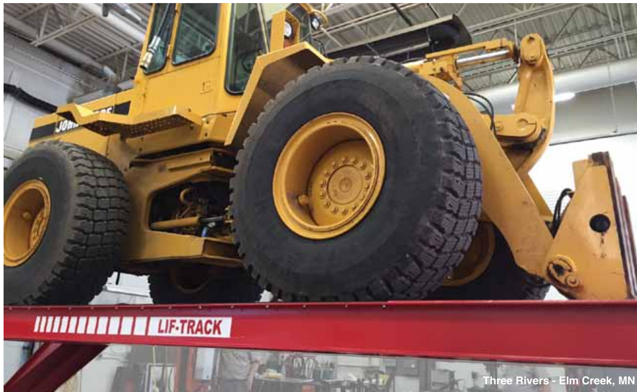
Three Rivers - Elm Creek, MN

Improved Preventive Maintenance with LIF-TRACK = Lower Cost .... and a Higher Quality of Work!