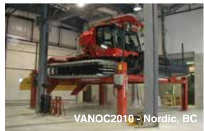
VANOC2010 - Nordic, BC