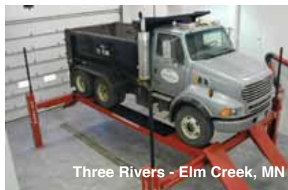
Three Rivers - Elm Creek, MN