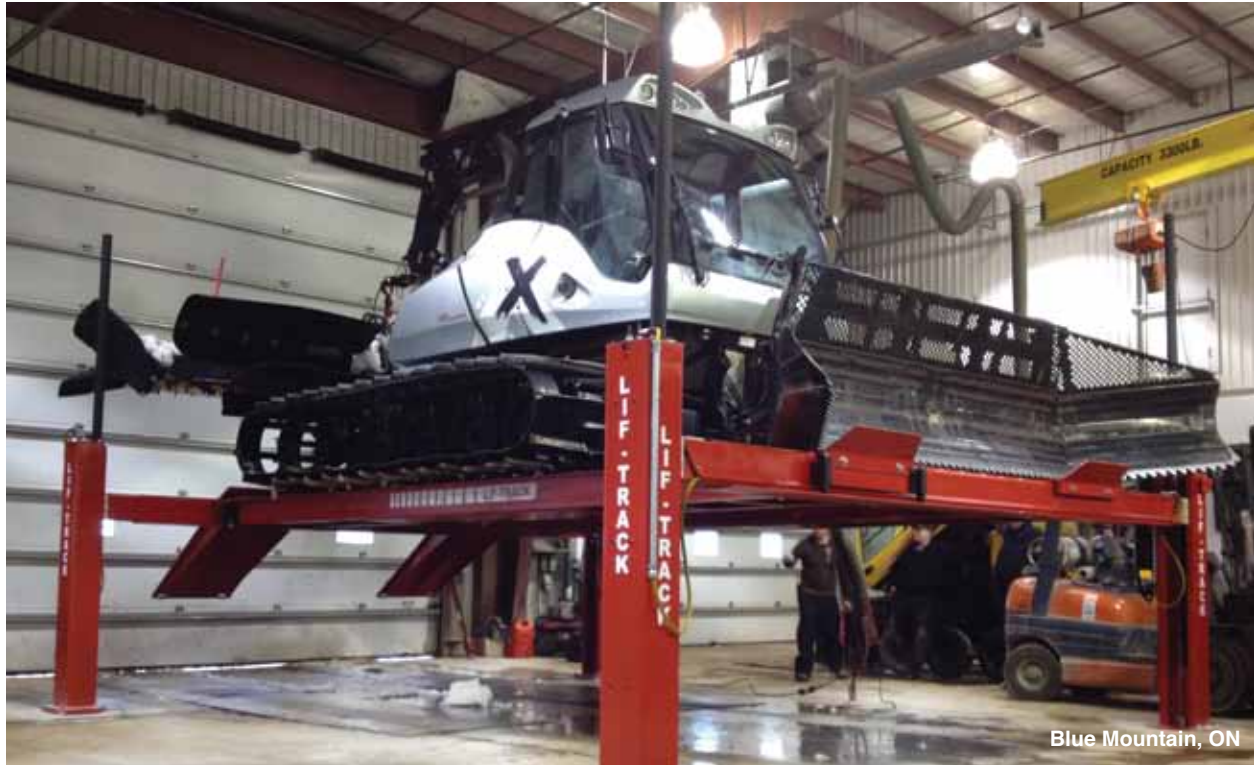
Blue Mountain, ON

The “All-Vehicle” Lift Service your whole fleet from ATV’s to Snowcats