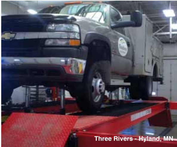
Three Rivers - Hyland, MN