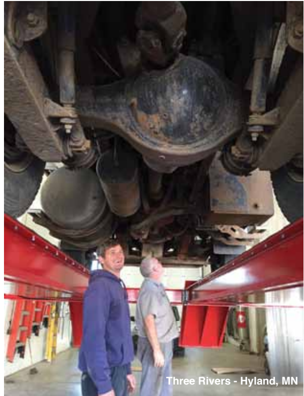
Three Rivers - Hyland, MN

“I only wish I had invested in LIF-TRACK sooner. I had no idea how beneficial it would be to our Vehicle Maintenance Dept until I saw for myself.”