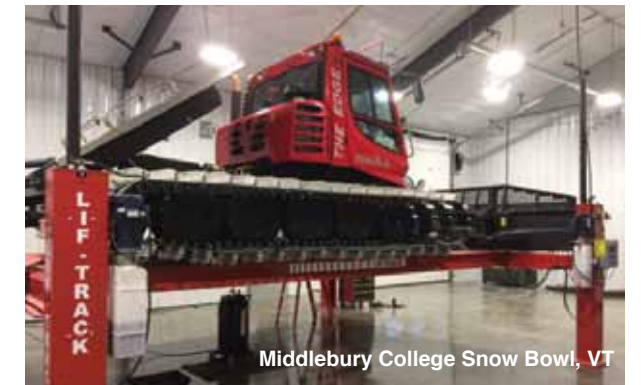
Middlebury College Snow Bowl, VT