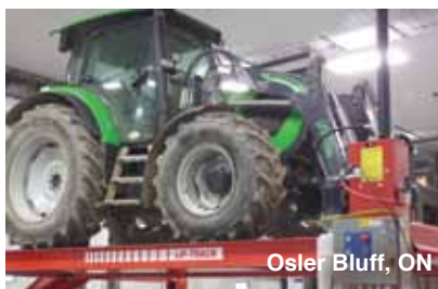
Osler Bluff, ON